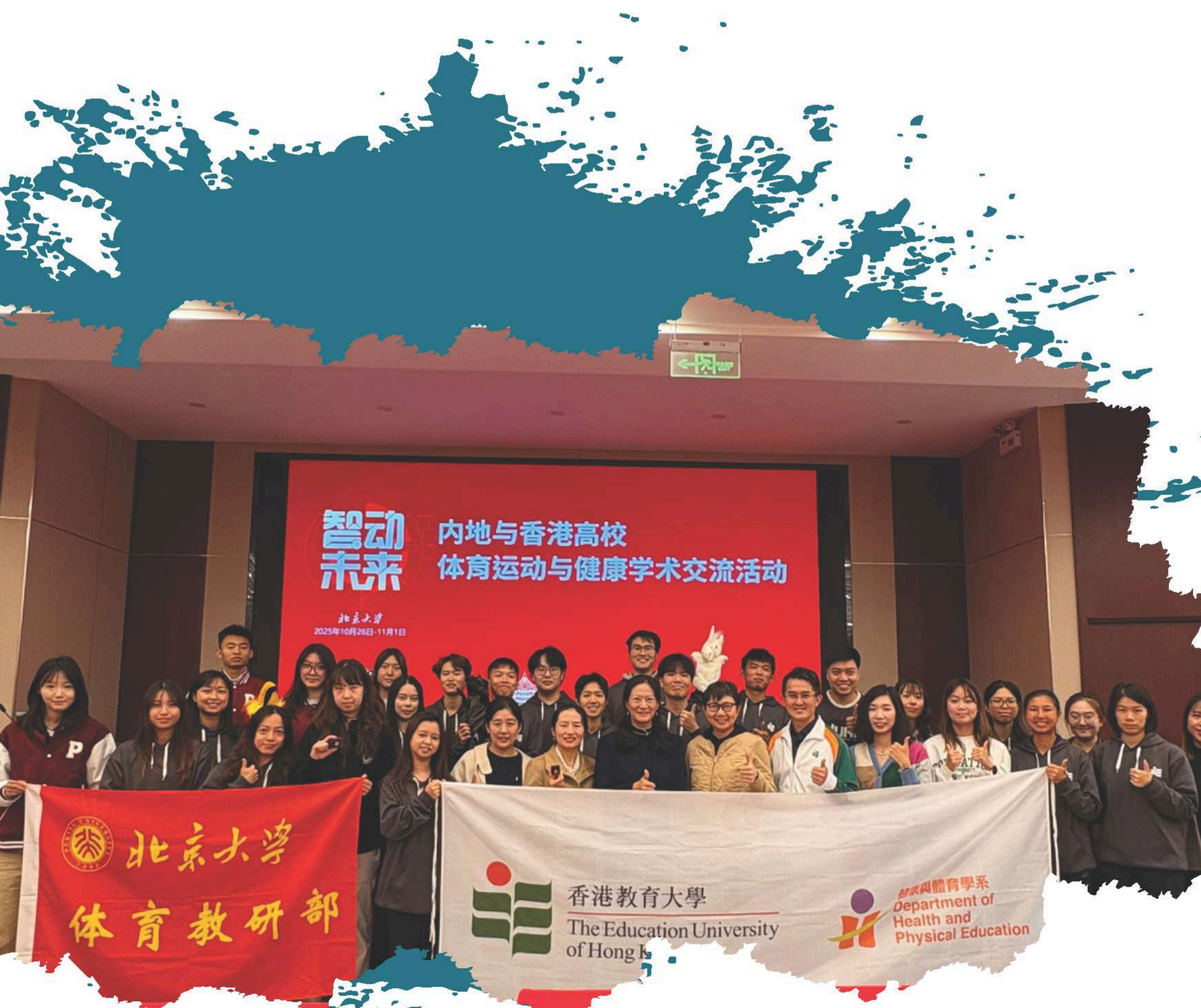
Students participated in a seven-day academic visit to Peking University under the “Ten Thousand People Plan”