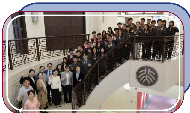
Students participated in a seven-day academic visit to Peking University under the “Ten Thousand People Plan”