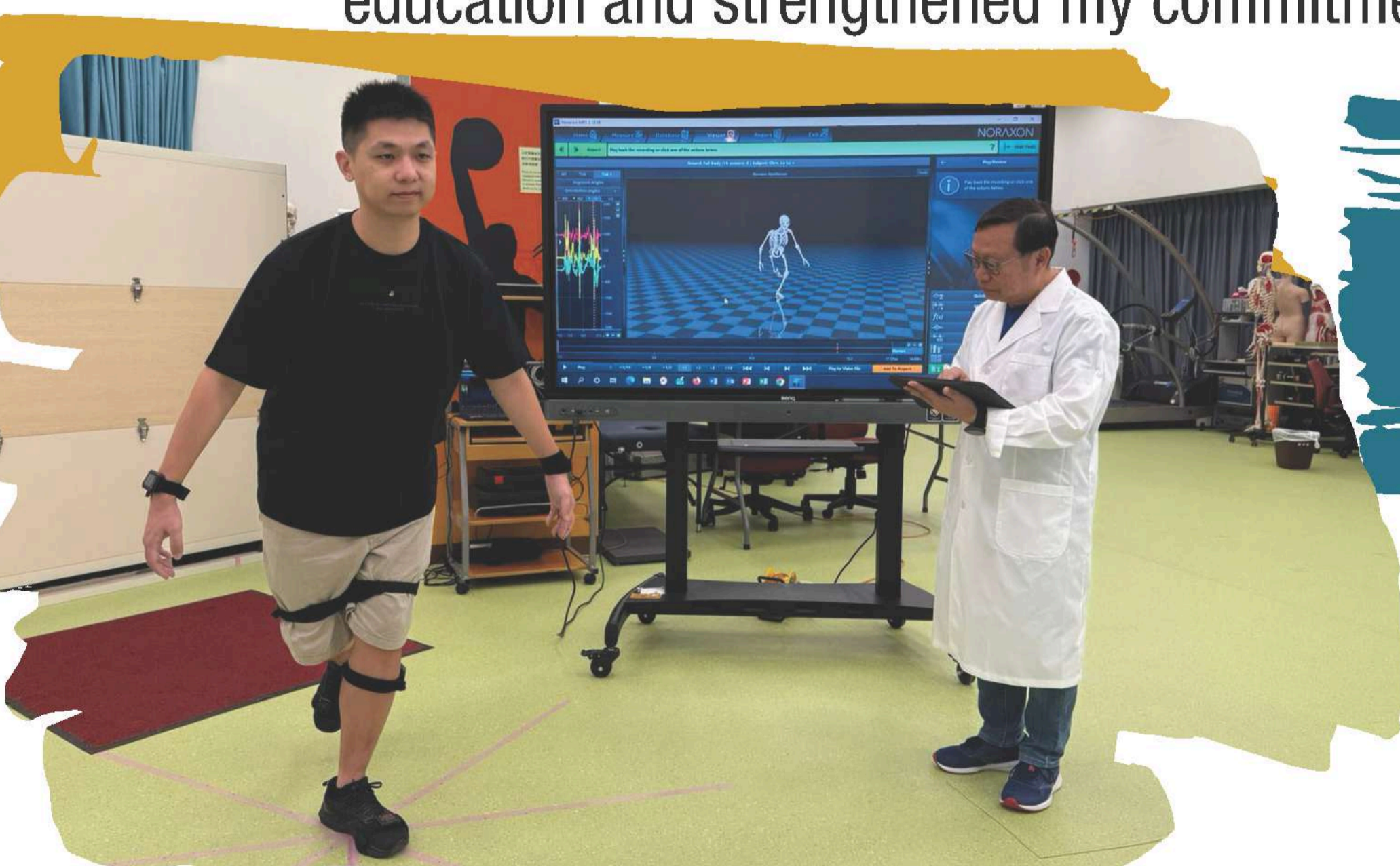
The well-equipped Human Performance Laboratory at EdUHK allows students to conduct thorough sports science experiments and research