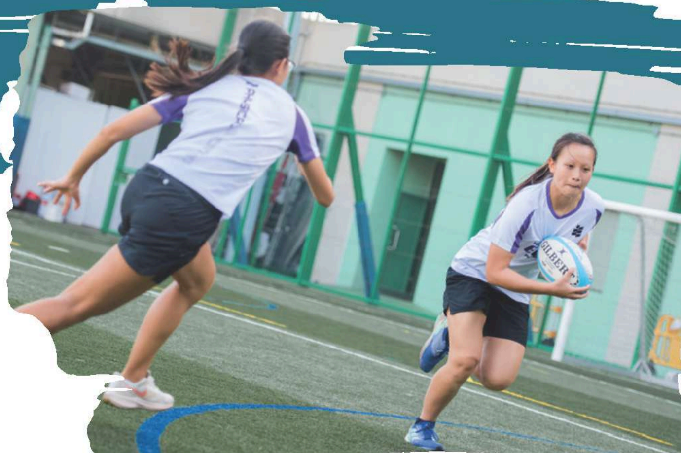
Students had the opportunities to take part in various types of sports, such as team ball games