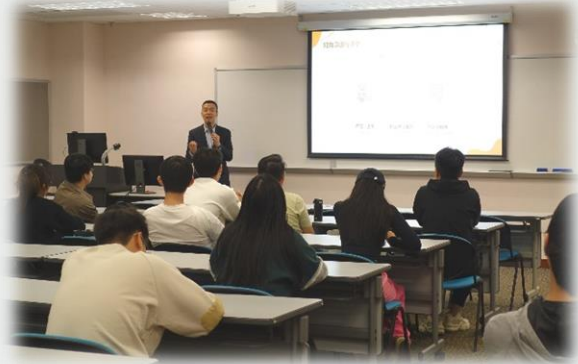
Workshop on Career Development