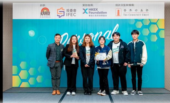
Personal Finance Ambassador