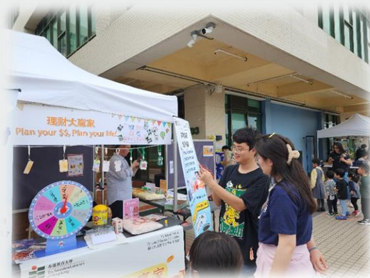
Roadshow on Personal Finance