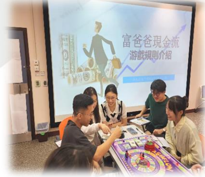
Financial Education Boardgame